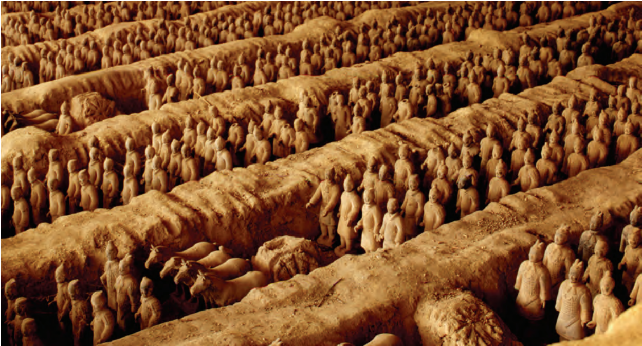
One detachment of the formidable, life-size, terra-cotta army buried in the vicinity of Qin Shihuangdi's tomb to protect the emperor after his death. The army consists of soldiers by the tens of thousands, along with weapons, horses, carts, and equipment.

such as palaces, roads, bridges, irrigation systems, defensive walls, and his tomb. Although those projects increased productivity and promoted the integration of China's various regions, they also generated tremendous ill will among laborers compelled to leave their families and their lands. Revolts began in the year after Qin Shihuangdi's death, and in 207 B.C.E. waves of rebels overwhelmed the Qin court, slaughtering government officials and burning state buildings. The Qin dynasty quickly dissolved in chaos.