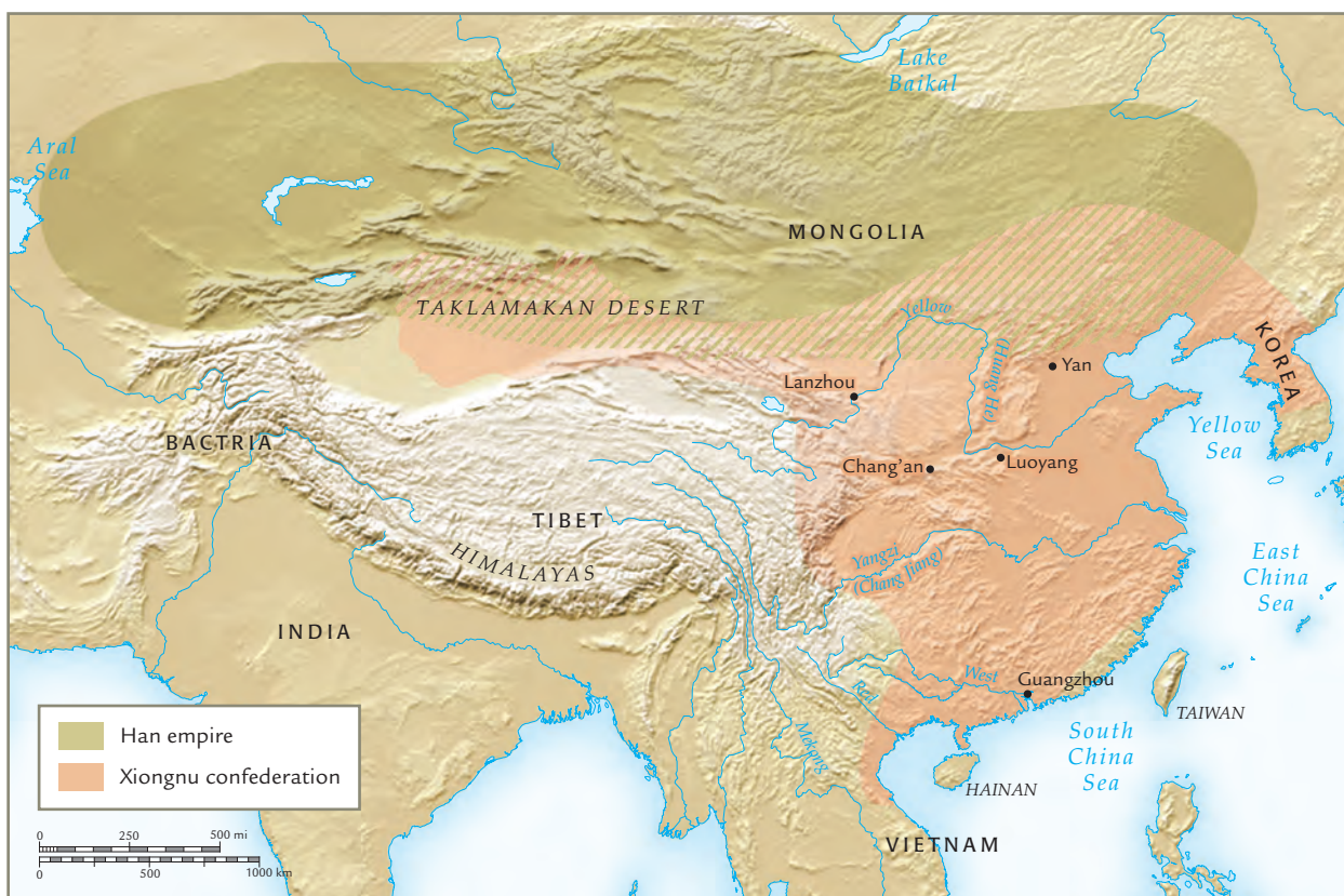
Map 8.2 East Asia and central Asia at the time of Han Wudi, ca. 87 B.C.E.

Note the indication in this map that Han authority extended to Korea and central Asia during the first century B.C.E. What strategic value did these regions hold for the Han dynasty?