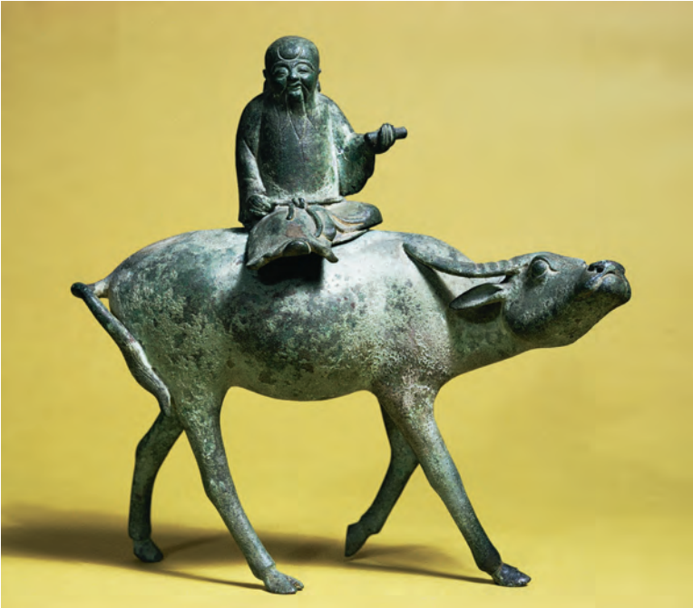
A jade statue produced about the tenth century C.E. depicts the sage Laozi on an ox. Legends reported that Laozi rode a blue ox from China to central Asia when spreading his teachings.

with the tedious affairs of the world). Wuwei called instead for individuals to live simply, unpretentiously, and in harmony with nature.