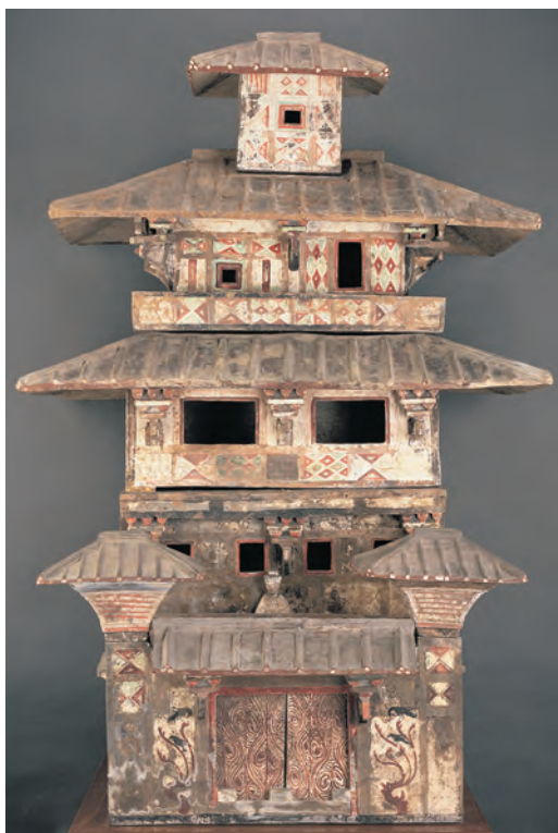
Clay model of an aristocratic house of the sort inhabited by a powerful clan during the Han dynasty. This model came from a tomb near the city of Guangzhou in southern China.