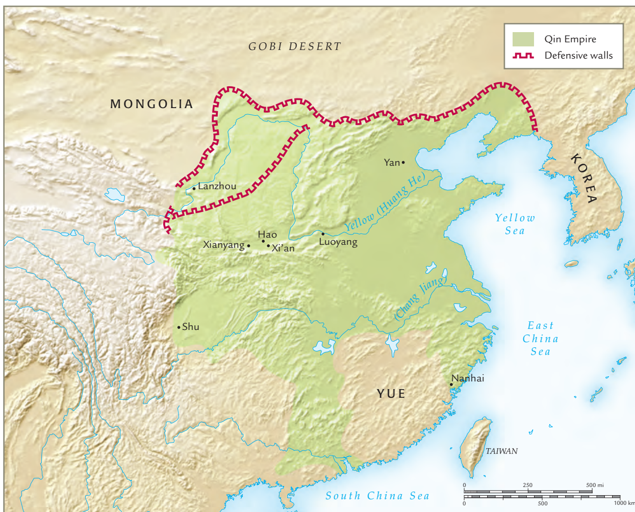
Map 8.1 China under the Qin dynasty, 221–207 B.C.E.

Compare the size of Qin territories to those of earlier Chinese kingdoms depicted in Maps 5.1 and 5.2. How is it possible to account for the greater reach of the Qin dynasty?