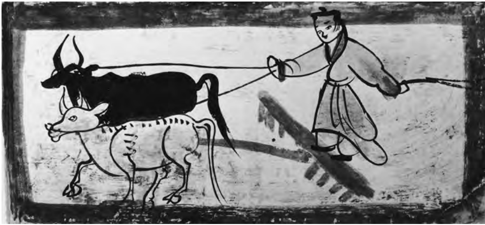
A painted brick depicts a peasant working in the fields with a team of oxen and a wooden harrow. By the Han dynasty, many plows of this type had iron teeth. Produced in the third or fourth century C.E., this brick painting came from a tomb in Gansu Province in western China.

of heaven had passed from the Han to his family, he seized the throne. Wang Mang then introduced a series of wide-ranging reforms that have prompted historians to refer to him as the “socialist emperor.”