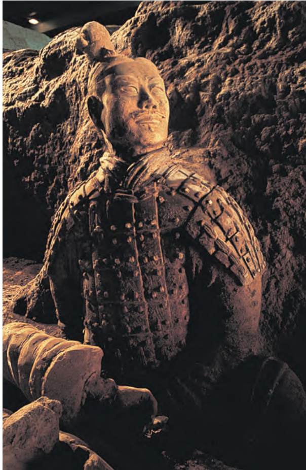
A life-size model of an infantryman suggests the discipline that drove the armies of Qin Shihuangdi.

The First Emperor took his policy seriously and enforced it earnestly. In the year following his decree, Qin Shihuangdi sentenced some 460 scholars residing in the capital to be buried alive for their criticism of his regime, and he forced many other critics from the provinces into the army and dispatched them to dangerous frontier posts. For the better part of a generation, there was no open discussion of classical