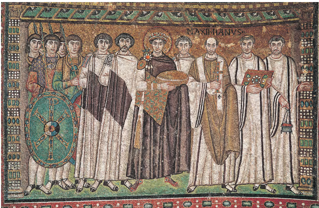
Justinian wears imperial purple robes in this mosaic, from the church of San Vitale in Ravenna, which depicts him in the company of ecclesiastical, military, and court officials.

Justinian's accomplishment, however, did not long survive his rule. Byzantium simply did not possess the resources to sustain Belisarius's conquests. Reconstitution of the Roman empire would have required a long-term occupation of reconquered regions and a costly reassertion of imperial authority. Byzantine forces were unable to hold Rome for very long, and the city of Ravenna on Italy's Adriatic coast became the headquarters of Byzantine authority in the western Mediterranean. As a result, Ravenna possesses magnificent Byzantine art and architecture. But Justinian's dream of restoring Roman authority throughout the Mediterranean basin soon faded.