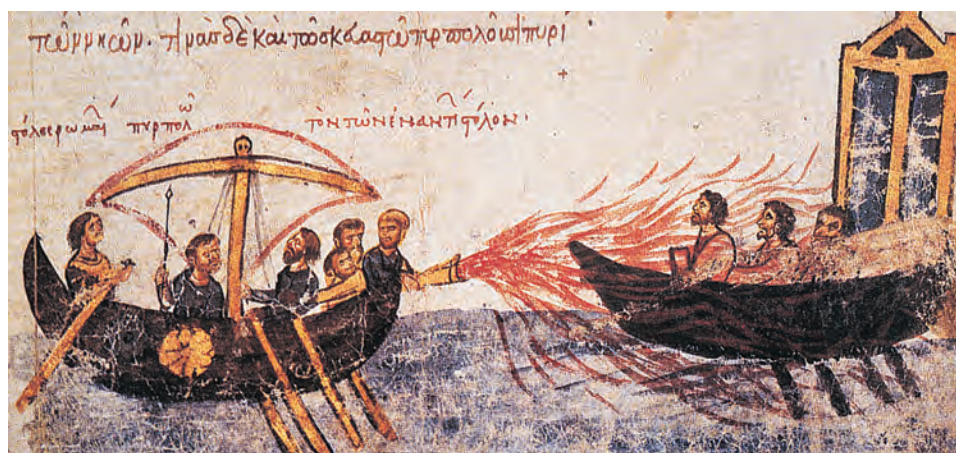
Illustration in a manuscript depicts Byzantine naval forces turning Greek fire on their Arab enemies.

defense and its civil administration. Generals received their appointments from the imperial government, which closely supervised their activities to prevent decentralization of power and authority. Generals recruited armies from the ranks of free peasants, who received allotments of land in exchange for military service. The armies proved to be effective military forces, and the system as a whole strengthened the class of free peasants, which in turn solidified Byzantium's agricultural economy. The theme system enabled Byzantine forces to mobilize quickly and resist further Islamic advances and also undergirded the political order and social organization of the empire from the eighth through the twelfth century.