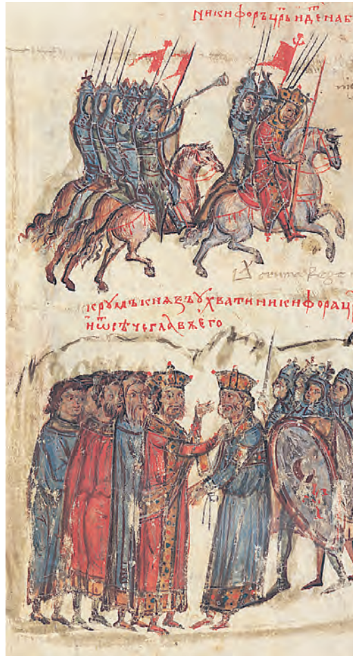
This illustration from a twelfth-century manuscript depicts ninth-century incursions of Bulgarians into Byzantine territory, culminating in a lecture by the Bulgarian king to the Byzantine emperor, shown here with bound hands.

The creation of a written Slavic language enabled Slavic peoples to organize complex political structures and develop sophisticated traditions of thought and literature. More immediately, the Cyrillic alphabet stimulated conversion to Orthodox Christianity. Missionaries translated the Christian scriptures and church rituals into Slavonic, and Cyrillic writing helped them explain Christian values and ideas in Slavic terms. Meanwhile, schools organized by missionaries ensured that Slavs would receive religious instruction with their introduction to basic literacy. As a result, Orthodox Christianity deeply influenced the cultural traditions of many Slavic peoples.