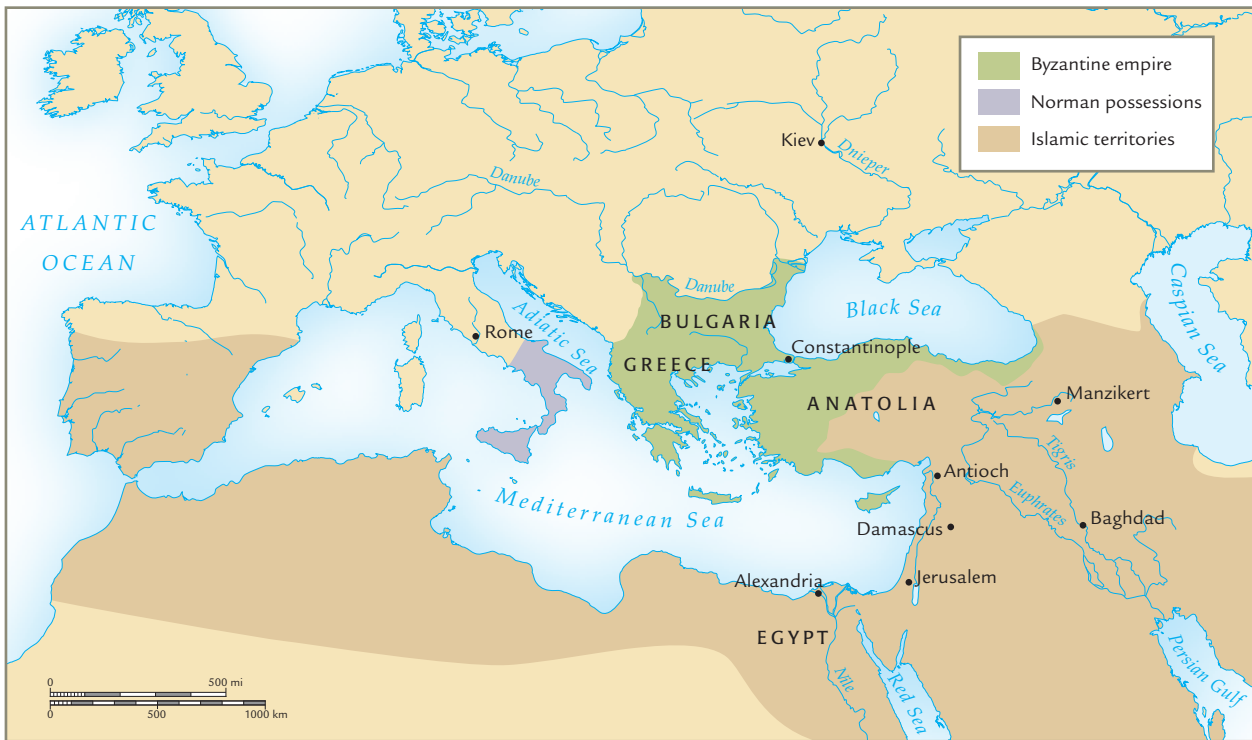
Map 13.2 The Byzantine empire and its neighbors, ca. 1100 C.E. After the emergence of Islam, the Byzantine empire shrank dramatically in size. To what extent does the expansion of Islam help explain the fact that Byzantine influence was strongest in eastern Europe after the seventh century C.E.?

service, and declining tax receipts from free peasants caused fiscal problems for the imperial government.