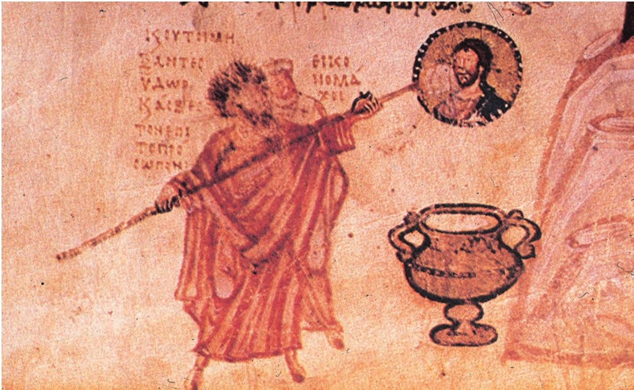
This illustration from a psalter prepared about 900 c.e. depicts an iconoclast whitewashing an image of Jesus painted on a wall.

interest in fine points of theology or high-level church administration, and they positively resented policies such as iconoclasm that infringed on cherished patterns of worship. For religious inspiration, the laity looked less to the church hierarchy than to the local monasteries.