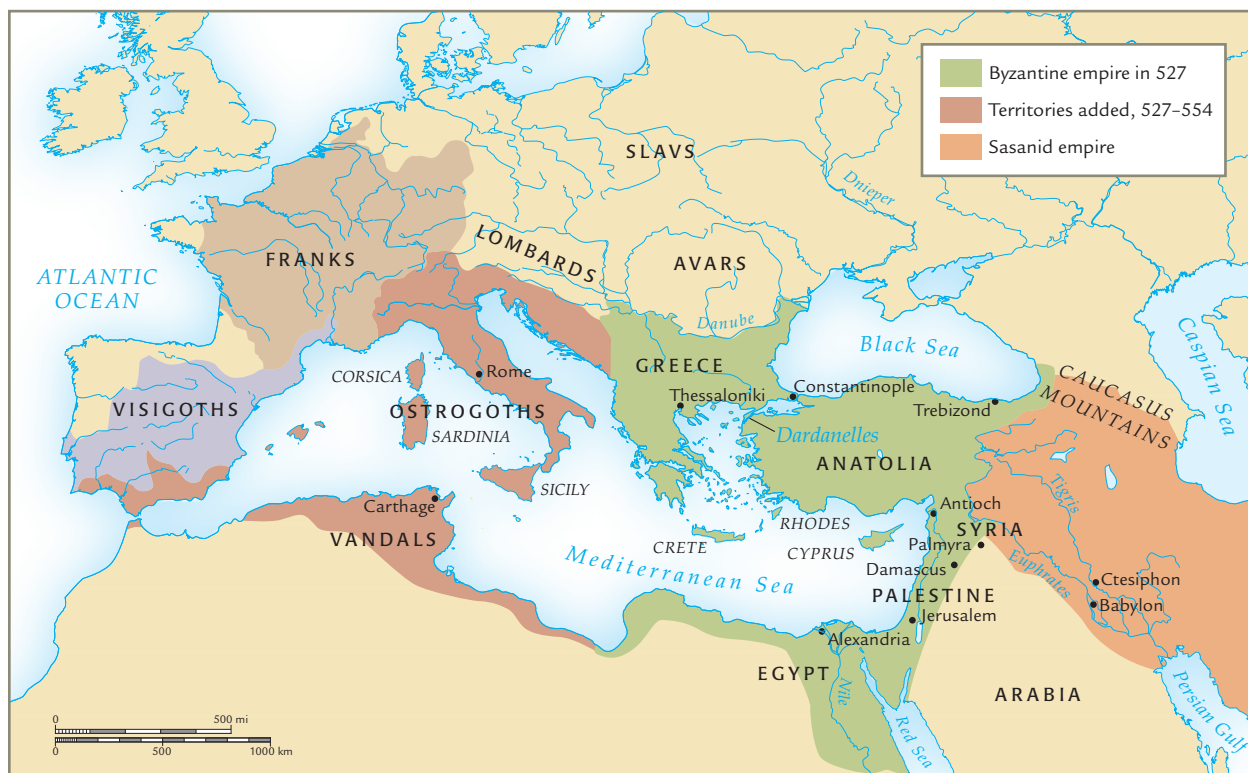
Map 13.1 The Byzantine empire and its neighbors, 527–554 C.E. Compare this map with Map 11.2 showing the Roman empire at its height. How did the territories of the Byzantine empire differ from those of the classical Roman empire?