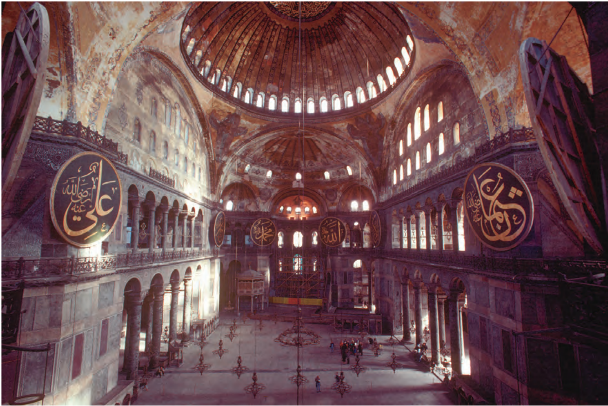
The interior of the church of Hagia Sophia (“Holy Wisdom”), built by Justinian and transformed into a mosque in the fifteenth century. The dome rises almost 60 meters (197 feet) above the floor, and its windows allow abundant light to enter the massive structure.

empire and overran large portions of the Byzantine empire as well. By the mid-seventh century, Byzantine Syria, Palestine, Egypt, and north Africa had fallen under Islamic rule. During the late seventh and early eighth centuries, Islamic forces threatened the heart of the empire and subjected Constantinople to prolonged siege (in 674–678 and again in 717–718). Byzantium resisted this northern thrust of Islam partly because of military technology. Byzantine forces used a weapon known as Greek fire —a devastating incendiary weapon compounded of sulphur, lime, and petroleum—which they launched at both the fleets and the ground forces of the invaders. Greek fire burned even when floating on water and thus created a serious hazard when deployed around wooden ships. On land it caused panic among enemy forces, since it was very difficult to extinguish and often burned troops to death. As a result of this defensive effort, the Byzantine empire retained its hold on Anatolia, Greece, and the Balkan region.