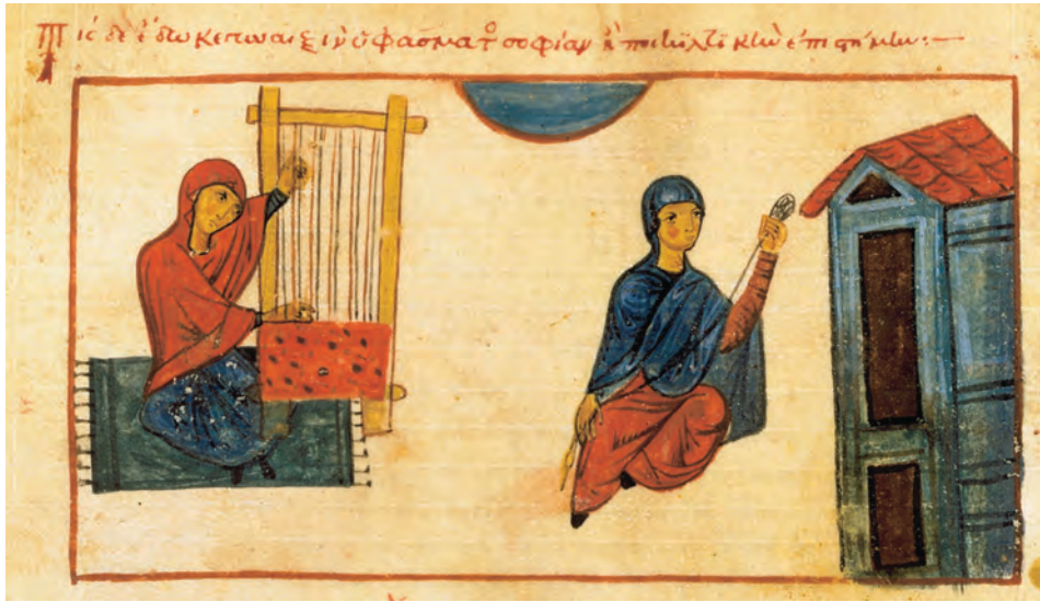
A manuscript illustration depicts one Byzantine woman weaving cloth (left) while another spins thread (right). Both women veil their hair for modesty. Women workers were prominent in Byzantine textile production.

tiles to the list of products manufactured in the Byzantine empire. Silk was a most important addition to the economy, and Byzantium became the principal supplier of this fashionable fabric to lands in the Mediterranean basin. The silk industry was so important to the Byzantine economy that the government closely supervised every step in its production and sale. Regulations allowed individuals to participate in only one activity—such as weaving, dyeing, or sales—to prevent the creation of a monopoly in the industry by a few wealthy or powerful entrepreneurs.