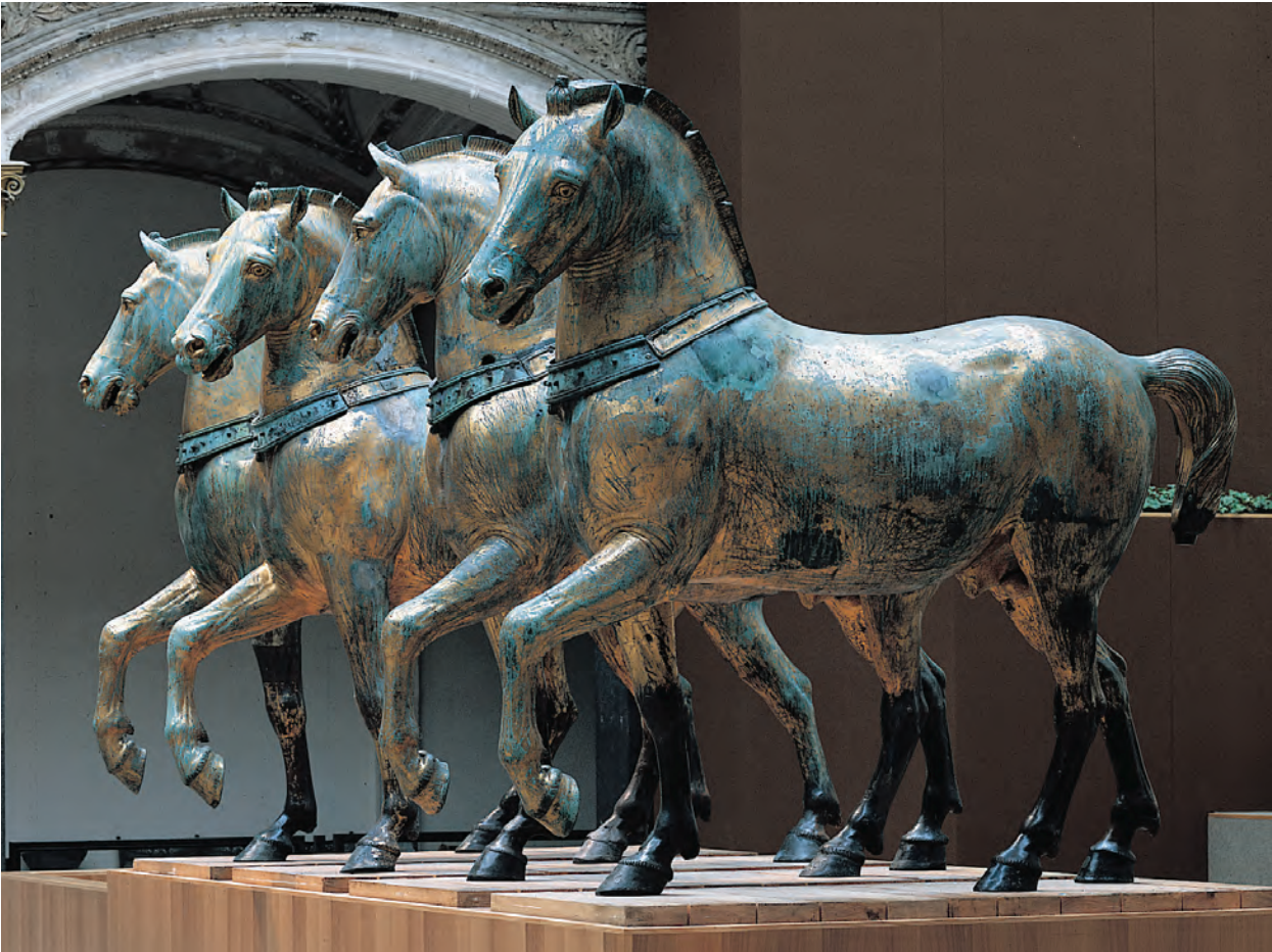
During the sack of Constantinople in 1204, crusading forces seized and carted away Byzantine treasures of all sorts—including the great bronze horses that now stand over the entrance to St. Mark's basilica in Venice.

Saljuqs, who beginning in the eleventh century sent waves of invaders into Anatolia. Given the military and financial problems of the Byzantine empire, the Saljuqs found Anatolia ripe for plunder. In 1071 they subjected the Byzantine army to a demoralizing defeat at the battle of Manzikert. Byzantine factions then turned on each other in civil war, allowing the Saljuqs almost free rein in Anatolia. By the late twelfth century, the Saljuqs had seized much of Anatolia, and crusaders from western Europe held most of the remainder.