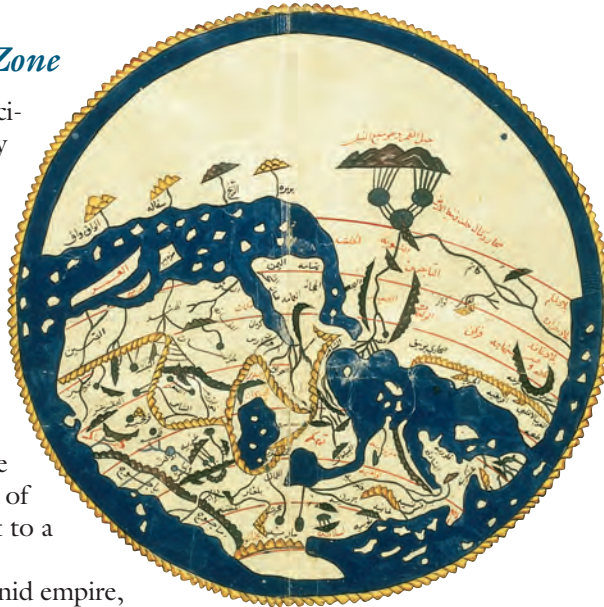
A map produced in the eleventh century by the Arab geographer al-Idrisi shows the lands known and reported by Muslim merchants and travelers. Note that, in accordance with Muslim cartographic convention, this map places south at the top and north at the bottom.

Meanwhile, innovations in nautical technology contributed to a steadily increasing volume of maritime trade in the Red Sea, Persian Gulf, Arabian Sea, and Indian Ocean. Arab and Persian mariners borrowed the compass from its Chinese inventors and used it to guide them on the high seas. From southeast Asian and Indian mariners, they borrowed the lateen sail, a triangular sail that increased a ship's maneuverability.