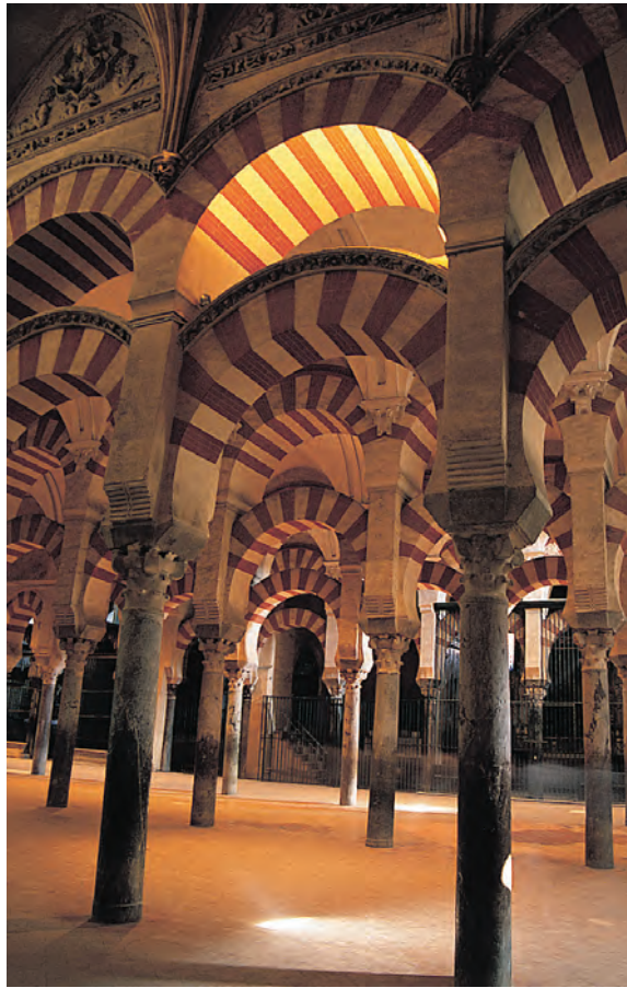
Interior of the mosque at Córdoba, originally built in the late eighth century and enlarged during the ninth and tenth centuries. One of the largest structures in the dar al-Islam , the mosque rests on 850 columns and features nineteen aisles.

The prosperity of Islamic Spain, known as al-Andalus, illustrates the far-reaching effects of long-distance trade during the Abbasid era. Most of the Iberian peninsula