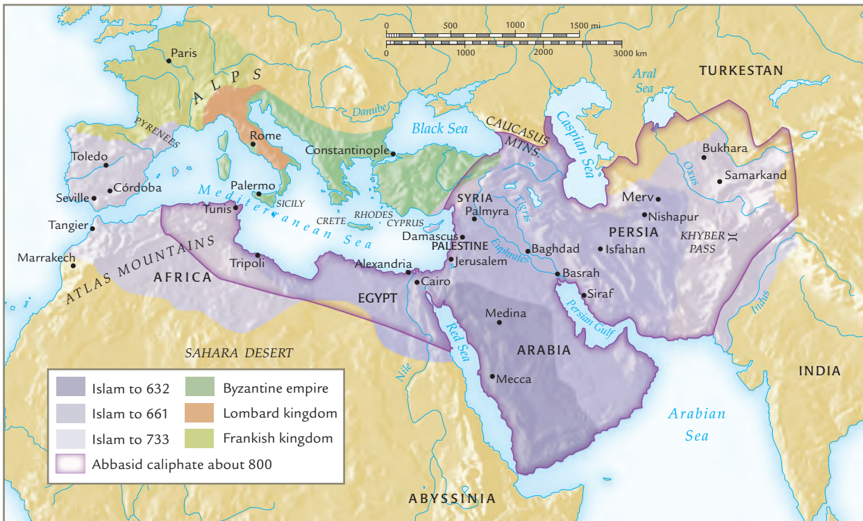
Map 14.1 The expansion of Islam, 632–733 C.E. During the seventh and eighth centuries, the new faith of Islam expanded rapidly and dramatically beyond its Arabian homeland. How might you explain the spread of a new faith? What political and cultural effects followed from the expansion of Islam?

ambitions, personal differences, and clan loyalties complicated their deliberations, however, and disputes soon led to the rise of factions and parties within the Islamic community.