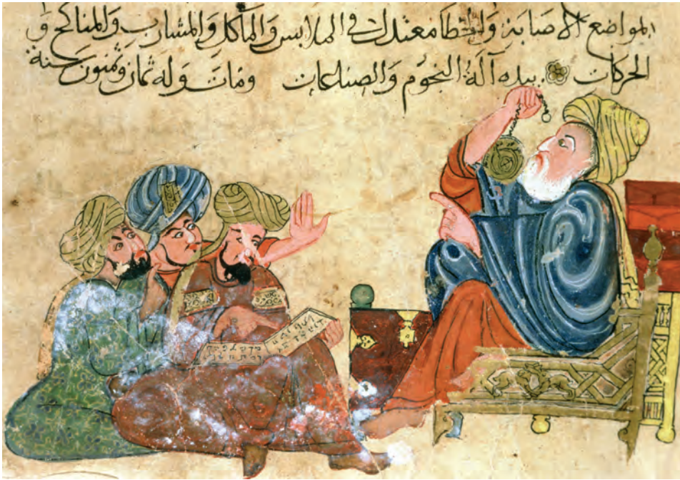
An illustration from a thirteenth-century, Arabic-language manuscript depicts the Greek philosopher Aristotle teaching three students about the astrolabe, an instrument that enabled the user to determine latitude.

simplified bookkeeping for Muslim merchants working in the lively commercial economy of the Abbasid dynasty.