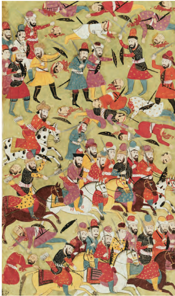
The early expansion of Islam was a bloody affair. This illustration from an Arabic manuscript of the thirteenth century depicts a battle between Muhammad's cousin Ali and his adversaries.

Beginning in the early eighth century, the Umayyad caliphs became alienated even from other Arabs. They devoted themselves increasingly to luxurious living rather than to zealous leadership of the umma , and they scandalized devout Muslims by their casual attitudes toward Islamic doctrine and morality. By midcentury the Umayyad caliphs faced not only the resistance of the Shia, whose members continued to promote descendants of Ali for caliph, but also the discontent of conquered peoples throughout their empire and even the disillusionment of Muslim Arab military leaders.