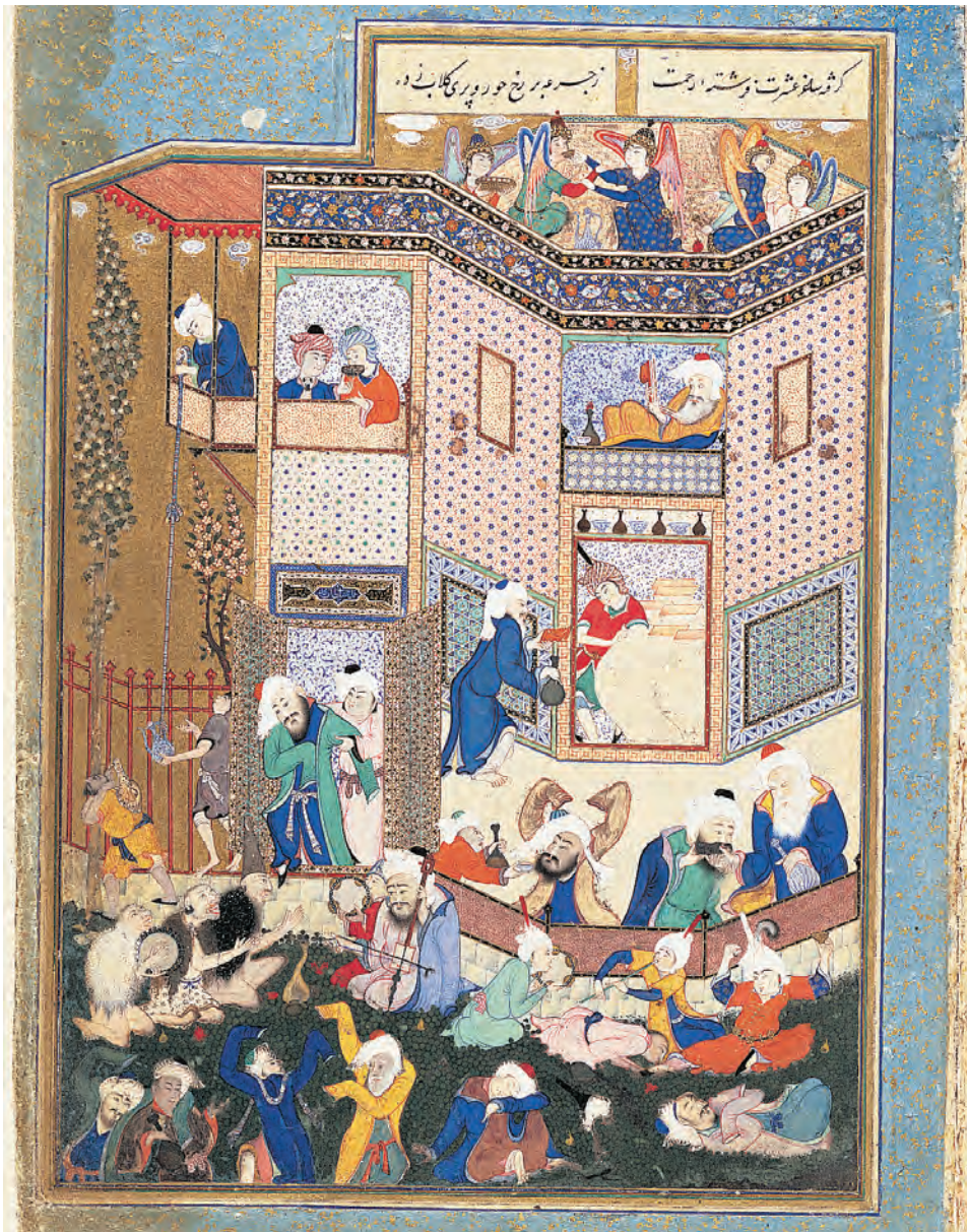
Through song, dance, and ecstatic experiences, sometimes enhanced by wine, Persian Sufis expressed their devotion to Allah, as in this sixteenth-century painting.

tolerated the continued observance of pre-Islamic customs, for example, as well as the association of Allah with deities recognized and revered in other faiths. The Sufis themselves led ascetic and holy lives, which won them the respect of the peoples to whom they preached. Because of their kindness, holiness, tolerance, and charismatic appeal, Sufis attracted numerous converts particularly in lands such as Persia and India, where long-established religious faiths such as Zoroastrianism, Christianity, Buddhism, and Hinduism had enjoyed a mass following for centuries.