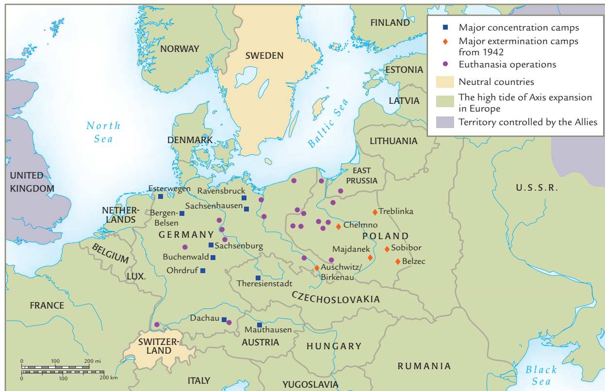
Map 373 The Holocaust in Europe, 1933-1945.

Observe the geographical locations of the concentration and extermination camps. Why were there more concentration camps in Germany and more extermination camps in Poland?