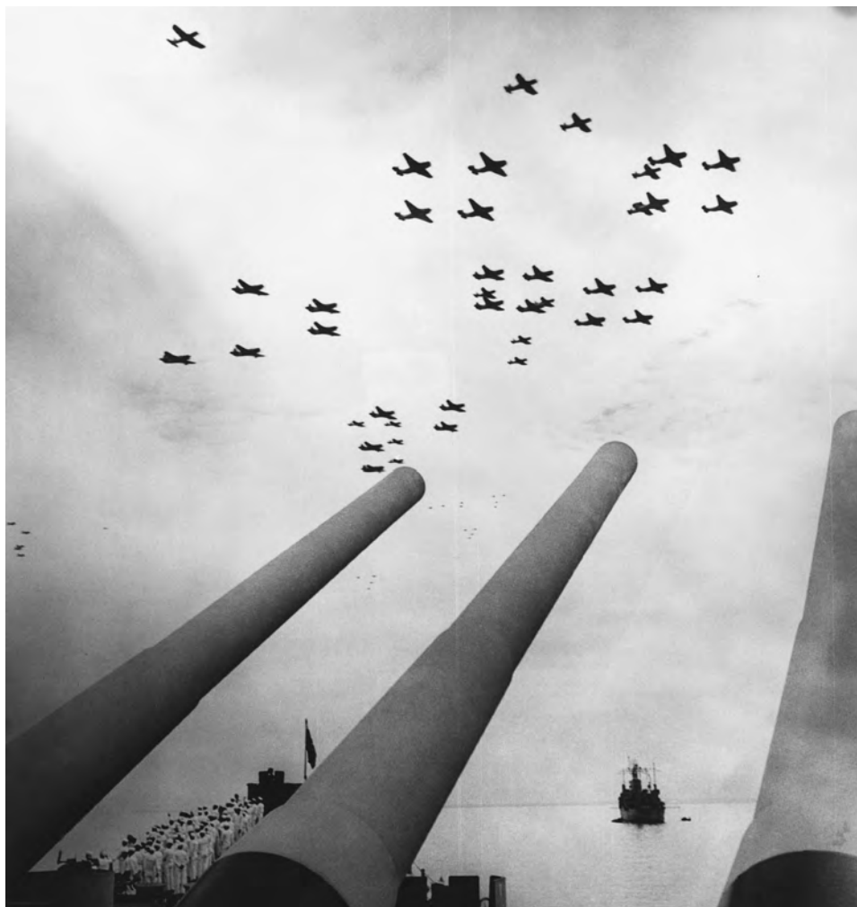
A photograph titled “Planes over Tokyo Bay,” taken from the U.S.S. Missouri , visually captured a sense of U.S. power and victory on V-J Day, 1945.

the atomic bomb, against the cities of Hiroshima and Nagasaki. The atomic bombs either instantaneously vaporized or slowly killed by radiation poisoning upward of two hundred thousand people.