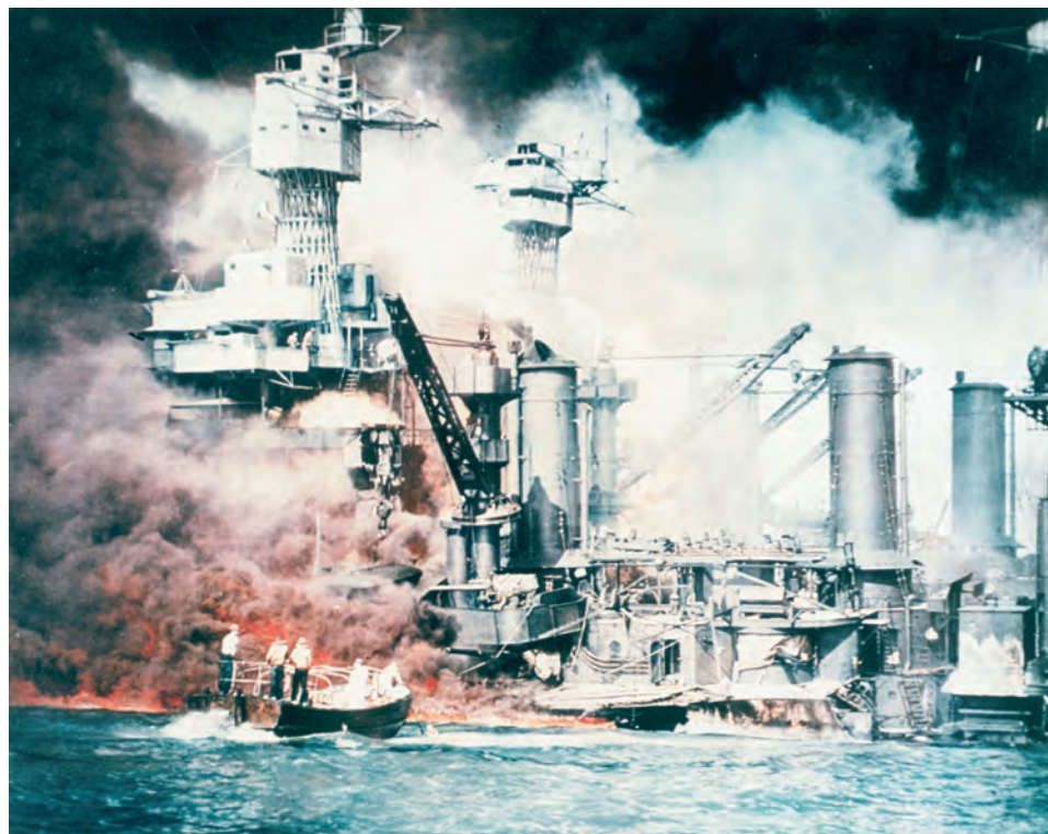
Flames consumed U.S. battleships in Pearl Harbor after the Japanese attack on 7 December 1941.

On 11 December 1941, though not compelled to do so by treaty, Hitler and Mussolini declared war on the United States. That move provided the United States with the only reason it needed to declare war on Germany and Italy. The United States, Great Britain, and the Soviet Union came together in a coalition that linked two vast and interconnected theaters of war, the European and Asian-Pacific theaters, and ensured the defeat of Germany and Japan. Adolf Hitler's gleeful reaction to the outbreak of war between Japan and the United States proved mistaken: "Now it is impossible for us to lose the war: We now have an ally who has never been vanquished in three thousand years." More accurate was Winston Churchill (1874–1965), prime minister of Britain, who expressed a vast sense of relief and a more accurate assessment of the situation when he said, "So we had won after all!"