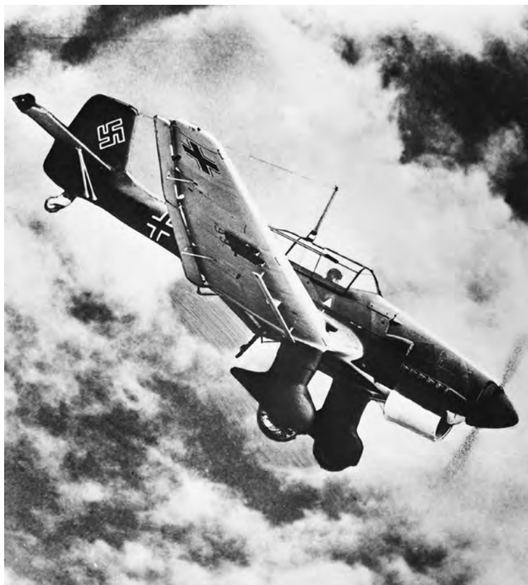
German dive-bombers like this one dominated the early air war in World War II and played a significant role in Blitzkrieg .

German forces, banking on their air force's ability to soften resistance and on their Panzer ("armored") columns' unmatched mobility and speed, moved into Poland unannounced on 1 September 1939. Within a month they subdued its western expanses while the Soviets took the eastern sections in accordance with the Nazi-Soviet pact. The Germans stunned the world, especially Britain and France, with their Blitzkrieg ("lightning war") and sudden victory.