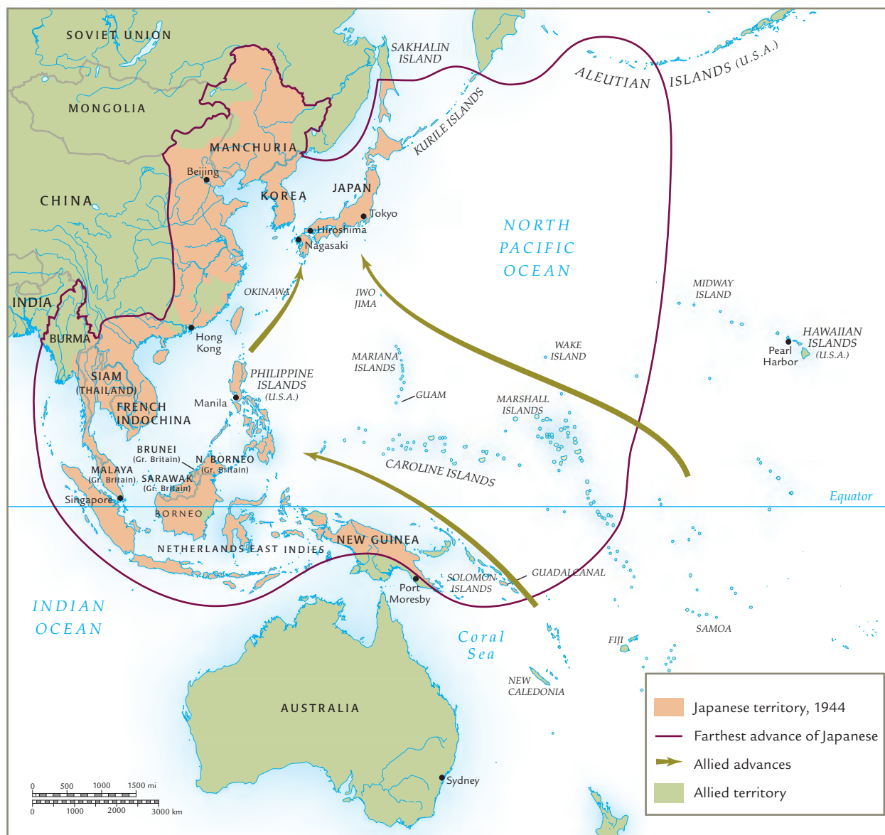
Map 37.2 World War II in Asia and the Pacific. Compare the geographical conditions of the Asian-Pacific theater with those of the European theater. What kinds of resources were necessary to win in the Asian-Pacific theater as opposed to the European theater?

defense mounted by Japanese forces and the 110,000 Okinawan civilians who died refusing to surrender, convinced many people in the United States that the Japanese would never capitulate.