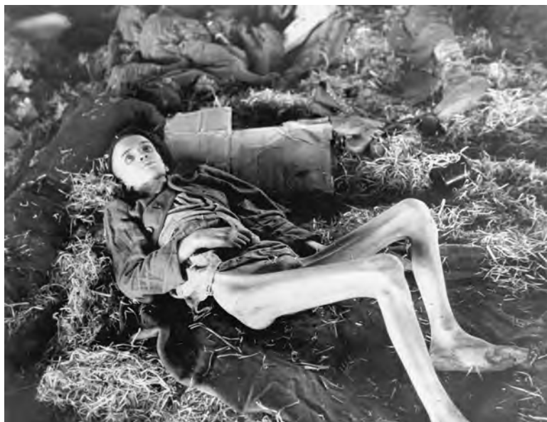
Titled “Abyss of Human Horror,” this photograph shows a survivor of the concentration camp at Nordhausen, Germany, on its liberation by Allies in 1945.

deadly retaliation meted out to people who resisted occupation, widespread resistance movements grew throughout the war. Life in resistance movements was tenuous at best and entailed great hardship—changing identities, hiding out, and risking capture and death. Nevertheless, the resisters kept alive their nations’ hopes for liberation.