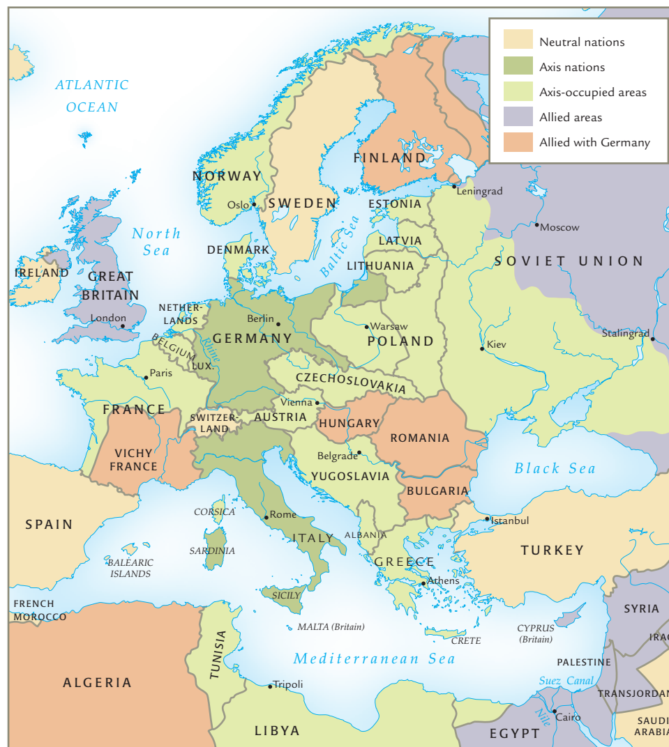
Map 37.1 High tide of Axis expansion in Europe and north Africa, 1942-1943. Observe the number of nations occupied by or allied with the Axis powers. Given Axis dominance in Europe, what factors finally allowed the Allies to turn the tide of war in their favor?

quired the region's resources and therefore sought to build a "Greater East Asia Co-Prosperty Sphere." The appeal to Asian independence at first struck a responsive chord, but conquest and brutal occupation made it soon obvious to most Asians that the real agenda was "Asia for the Japanese." Proponents of the Greater East Asia Co-Prosperty Sphere advocated Japan's expansion in Asia and the Pacific while cloaking their territorial and economic designs with the idealism of Asian nationalism.