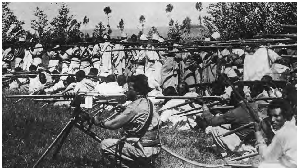
■ Ethiopian soldiers train with outmoded equipment that proves no match for Italian forces.

France, Czechoslovakia, Yugoslavia, Hungary, and Austria—also shared in the blame. Hitler’s scheme for ridding Germany of its enemies and reasserting its power was remilitarization—which was legally denied to Germany under the Versailles Treaty. Germany’s dictator abandoned the peaceful efforts of his predecessors to ease the provisions of the treaty and proceeded unilaterally to destroy it step-by-step. Hitler’s aggressive foreign policy helped relieve the German public’s feeling of war shame and depression trauma. After withdrawing Germany from the League of Nations in 1933, his government carried out an ambitious plan to strengthen the German armed forces. Hitler reinstated universal military service in 1935, and in the following year his troops entered the previously demilitarized Rhineland that bordered France. Germany joined with Italy in the Spanish Civil War, where Hitler’s troops, especially the air force, honed their skills. In 1938 Hitler began the campaign of expansion that ultimately led to the outbreak of World War II in Europe.