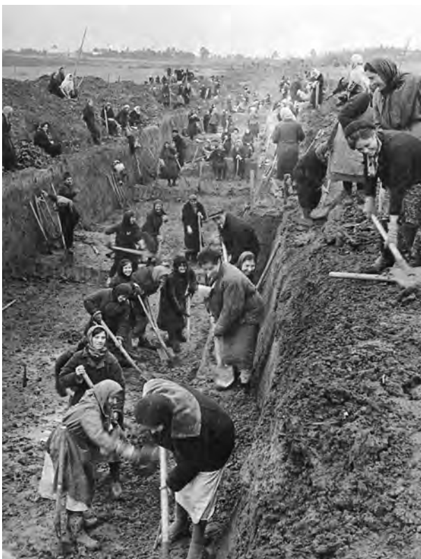
Outside Moscow, Soviet women dig antitank trenches against the Nazi onslaught.

The Japanese hoped to destroy American naval capacity in the Pacific with an attack at Pearl Harbor and to clear the way for the conquest of southeast Asia and the creation of a defensive Japanese perimeter that would thwart the Allies’ ability to strike at Japan’s homeland. On 7 December 1941, “a date which will live in infamy,” as Franklin Roosevelt concluded, Japanese pilots took off from six aircraft carriers to attack Hawai‘i. More than 350 Japanese bombers, fighters, and torpedo planes struck in two waves, sinking or disabling eighteen ships and destroying more than two hundred. Except for the U.S. aircraft carriers, which were out of the harbor at the time, American naval power in the Pacific was devastated.