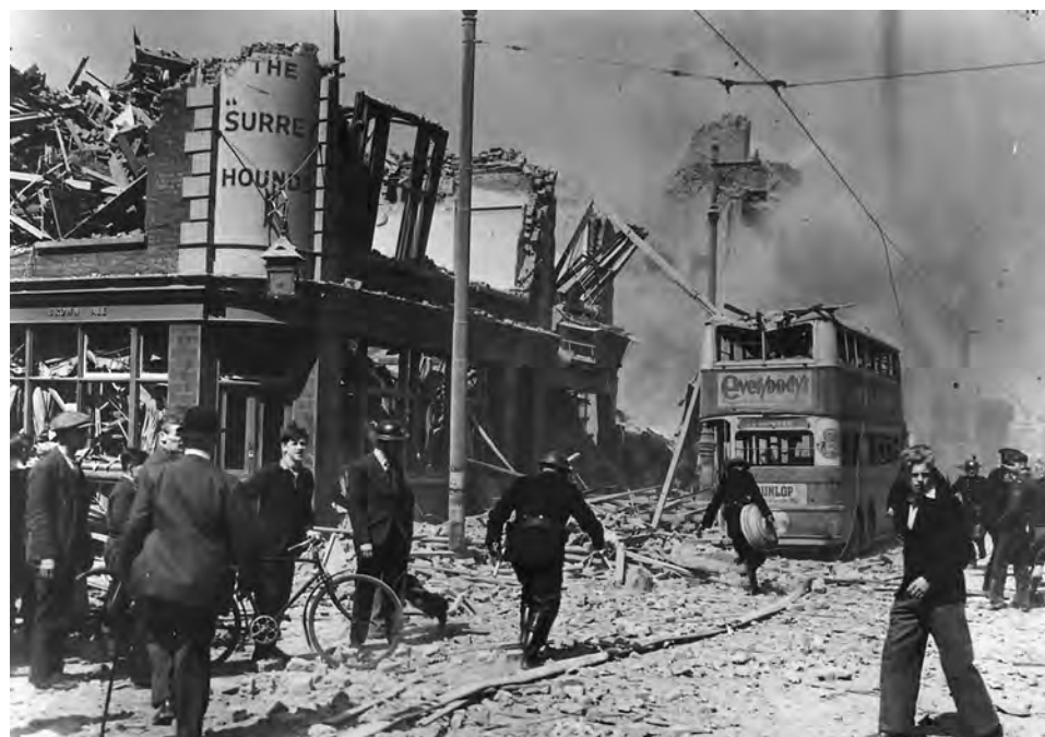
The devastation caused by German bombardments is visible in the wreckage of a London neighborhood in 1944.

capacity of Soviet industry outstripped that of German industry. The Soviets also received crucial equipment from their allies, notably trucks from the United States. By the time the German forces reached the outskirts of Moscow, fierce Soviet resistance had produced eight hundred thousand German casualties.