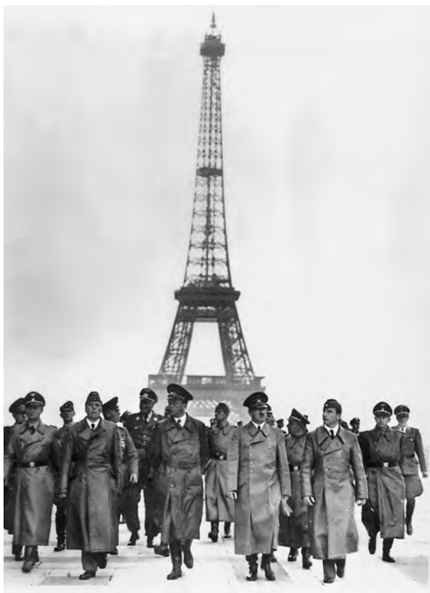
Adolf Hitler proudly walks through conquered Paris in 1940, with the Eiffel Tower as a backdrop.

However, German Blitzkrieg tactics that had earlier proved so effective in Poland and western Europe failed the Germans in the vast expanses of Russia. Hitler and his military leaders underestimated Soviet personnel reserves and industrial capacity. Within a matter of weeks the 150 German divisions faced 360 divisions of the Red Army. Also, in the early stages of the war Stalin ordered Soviet industry to relocate to areas away from the front. About 80 percent of firms manufacturing war matériel moved to the Ural Mountains between August and October 1941. As a result, the