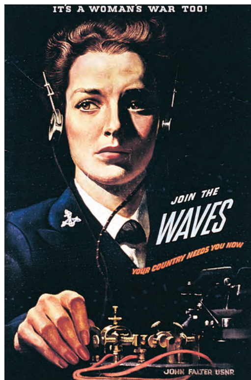
A WAVES recruitment poster proclaims “It’s A Woman’s War Too!”

Once forced into this imperial prostitution service, the “comfort women” catered to between twenty and thirty men each day. Stationed in war zones, the women often