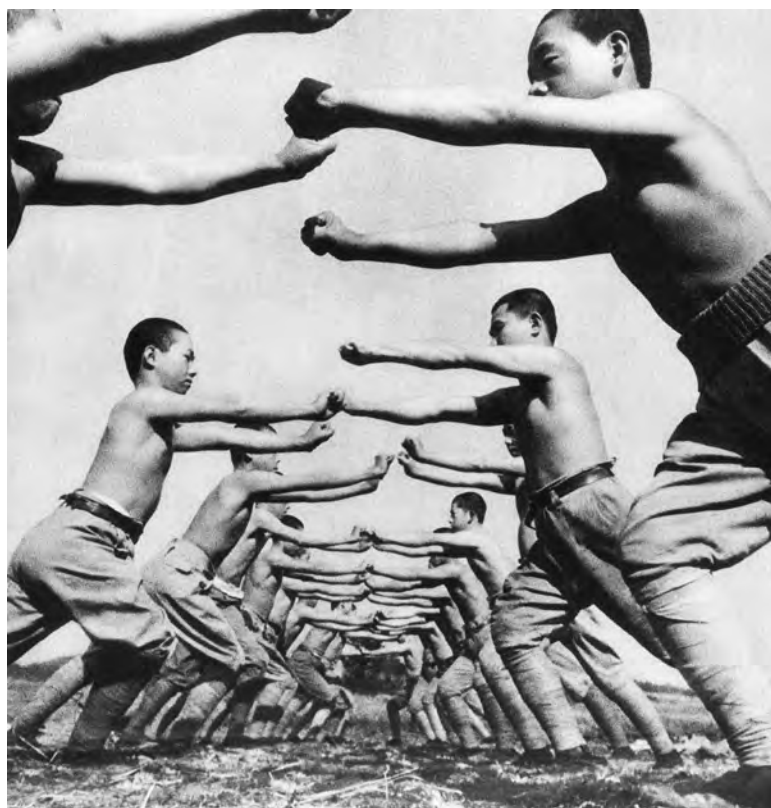
Japanese soldiers in 1938 engaged in strenuous physical education and kept fit in order to fight the Chinese.

The Japanese invasion of China met with intense international opposition, but by that time Japan had chosen an