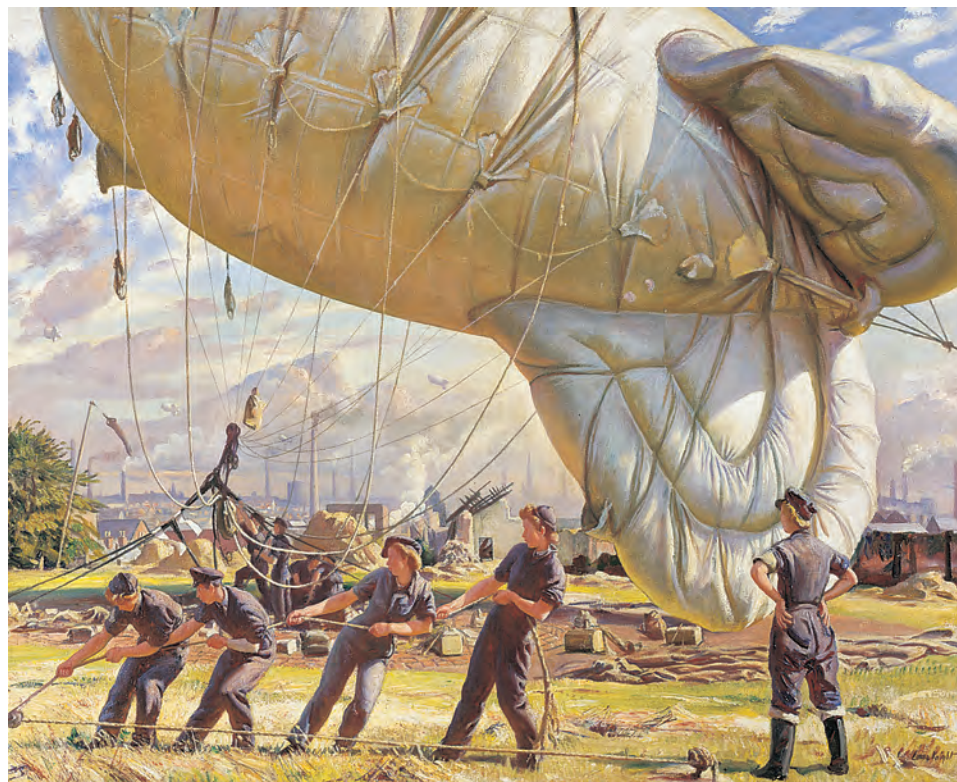
■ British women handle a balloon used for defense in the Battle of Britain.

confronted the same risks as soldiers, and many became casualties of war. Others were killed by Japanese soldiers, especially if they tried to escape or contracted venereal diseases. At the end of the war, soldiers massacred large numbers of comfort women to cover up the operation. The impetus behind the establishment of comfort houses for Japanese soldiers came from the horrors of Nanjing, where the mass rape of Chinese women had taken place. In trying to avoid such atrocities, the Japanese army created another horror of war. Comfort women who survived the war experienced deep shame and hid their past or faced shunning by their families. They found little comfort or peace after the war.