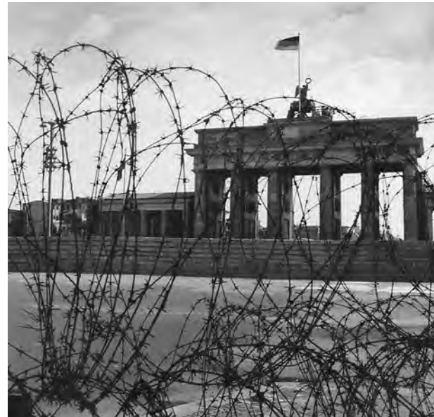
Barbed wire and a concrete wall in front of the Brandenburg Gate in Berlin symbolized the cold war division of Europe.

On the early morning of 25 June 1950, the unstable political situation in Korea came to a head. Determined to unify Korea by force, the Pyongyang regime ordered more than one hundred thousand troops across the thirty-eighth parallel in a surprise attack, quickly pushing back South Korean defenders and capturing Seoul on 27 June. Convinced that the USSR had sanctioned the invasion, the U.S. government lost no time persuading the United Nations to adopt a resolution requesting all member states “to provide the Republic of Korea with all necessary aid to repel the aggressors.” Armed with a UN mandate and supported by token ground forces from twenty countries, the U.S. military went into action. U.S. forces were unable to dislodge the North Koreans, who inflicted a series of humiliating defeats on the Americans during the summer of 1950. In September, however, following an extremely risky but successful amphibious operation at Incheon (near Seoul) far behind North Korean lines, U.S. forces went on the offensive. Americans and their allies eventually pushed North Korean forces back to the thirty-eighth parallel, thereby fulfilling the UN mandate. Sensing an opportunity to unify all of Korea under a friendly government, U.S. leaders sent American forces into North Korea, where they soon occupied Pyongyang. Subsequent U.S. advances toward the Yalu River on the Chinese border caused the government of the