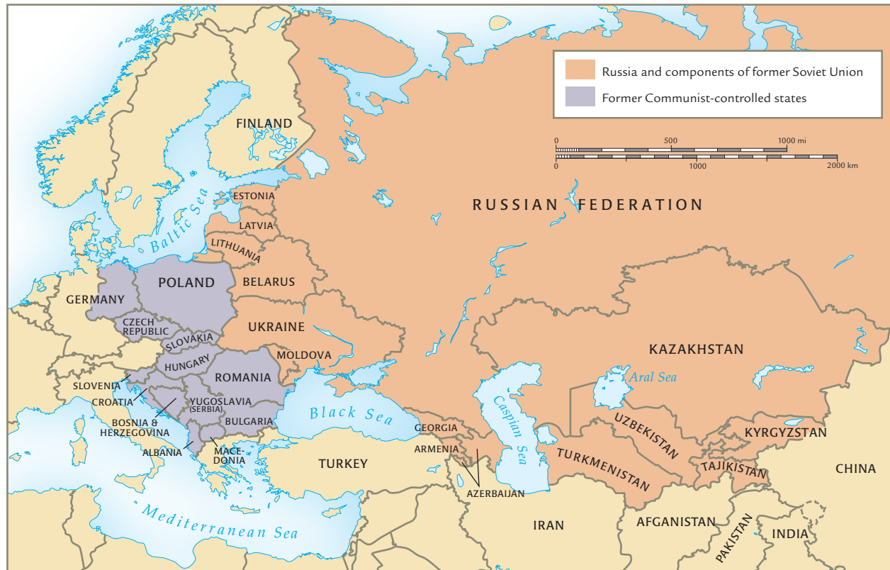
Map 38.3 The collapse of the Soviet Union and European communist regimes, 1991. Note the number of states suddenly created by the breakup of the Soviet Union. How would this affect the ability of each to survive, both economically and politically?

militarist nations in shambles, and the United States and the Soviet Union stepped into what could have been an uncomfortable vacuum in global leadership. Perilous and controlling it may have been, but the cold war that resulted from the ideological contest between the superpowers had ordered and defined the world for almost fifty years. The cold war also shaped how the nations and peoples of the world perceived themselves—as good capitalists fighting evil communists, as progressive socialists battling regressive capitalists, or as nonaligned peoples striving to follow their own paths. Although those perceptions placed constraints on the choices open to them, particularly given the control exerted by the United States and the USSR at the peak of their power, the choices nonetheless were familiar. At the end of the cold war, those easy choices disappeared. The stunning impact of the end of the cold war reverberated in policy-making circles and on the streets.