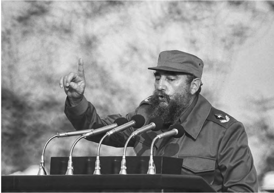
■ Prime Minister Fidel Castro of Cuba addresses a rally.

United States believed its dominance here was undisputed. Ironically, the cold war confrontation that came closest to unleashing nuclear war took place not at the expected flashpoints in Europe or Asia but on the island of Cuba.