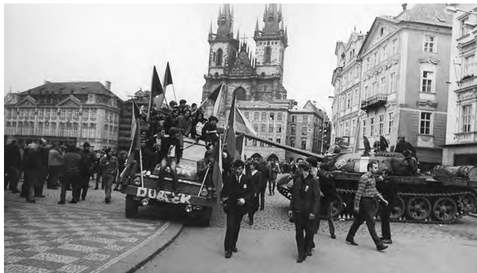
Czech citizens confront Warsaw Pact troops in Prague during the Soviet invasion in the spring of 1968.

a secret speech at the Twentieth Party Congress in February 1956. Khrushchev subsequently embarked on a policy of de-Stalinization, that is, the end of the rule of terror and the partial liberalization of Soviet society. Government officials removed portraits of Stalin from public places, renamed institutions and localities bearing his name, and commissioned historians to rewrite textbooks to deflate Stalin's reputation. The de-Stalinization period, which lasted from 1956 to 1964, also brought a thaw in government control and resulted in the release of millions of political prisoners. One of these was Alexandr Solzhenitsyn (1919–) who, thanks to Khrushchev's support, was able to publish his novel One Day in the Life of Ivan Denisovich (1962), a short and moving description of life in a Siberian forced labor camp. The new political climate in the Soviet Union tempted communist leaders elsewhere to experiment with domestic reforms and seek a degree of independence from Soviet domination.