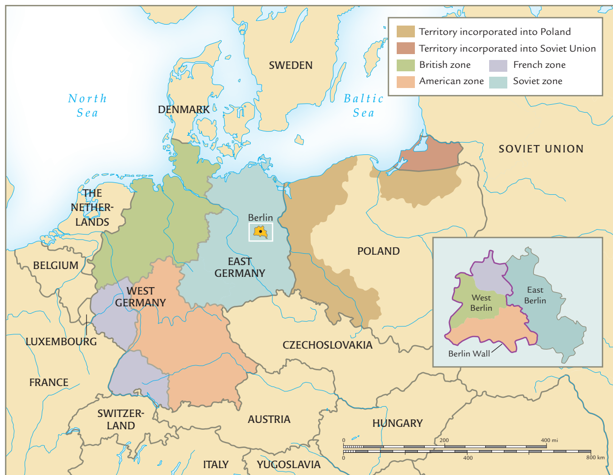
Map 38.1 Occupied Germany, 1945–1949. Locate the city of Berlin in Soviet-controlled territory. How was it possible for the British, American, and French to maintain their zones of control in Berlin, given such geographical distance from western Germany?