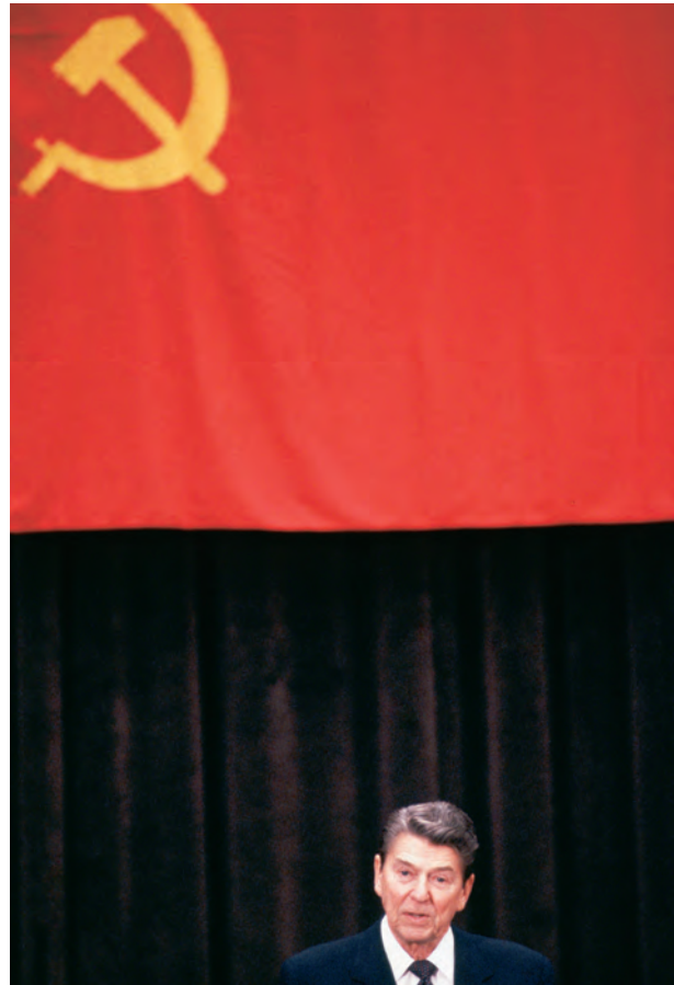
At a U.S./U.S.S.R. summit in 1985, a Soviet flag served as a dramatic backdrop and counterpoint to U.S. President Ronald Reagan's speech.

Emanating from the Soviet Union was the hope that reform might push the regimes of eastern and central Europe toward less harsh and more enlightened communist rule. Nikita Khrushchev's denunciation of the Stalin era and his vision of a more prosperous and humane communism inspired a generation of reformers in the Soviet Union and Europe. The brutal Soviet interventions in 1956 (Hungary) and 1968 (Czechoslovakia), however, dashed the aspirations and dreams of reformers. By the early 1970s, intellectuals and dissidents abandoned all hope for a humane socialism. The Polish intellectual Leszek Kolakowski echoed the sentiments of many reformers when he bitterly