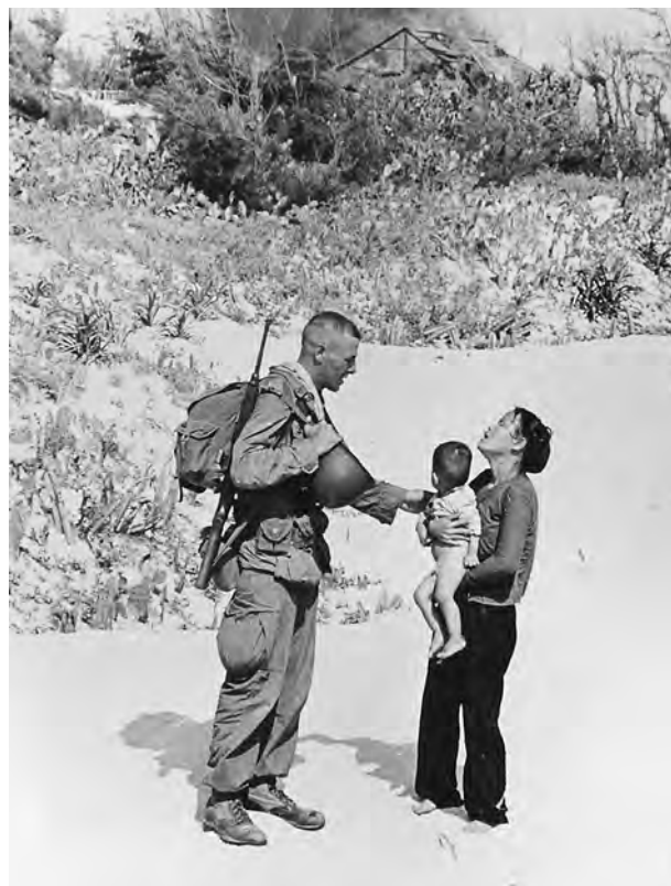
The Vietnam War: with her home going up in flames behind her, a Vietnamese woman pleads with a U.S. soldier.

Recognizing his country's distaste for the U.S. role in the Vietnam War, presidential candidate Richard Nixon pledged in 1968 to end the war. After his election, he implemented his strategy of turning over the war to the South Vietnamese (termed Vietnamization ) by escalating the conflict. Nixon extended the war into Cambodia through bombing and invasion in 1969 and 1970, and he resumed heavy bombing of North Vietnam. At the same time, however, he opened diplomatic channels to the Soviet Union and China, hoping to get them to pressure North Vietnam into a negotiated end to the war. Under those circumstances the continuation of the battle in Vietnam seemed futile. U.S. troops gradually withdrew from the conflict, and in January 1973 the U.S. phase of the Vietnam War ended with the Paris Peace Accords, a complex set of agreements signed