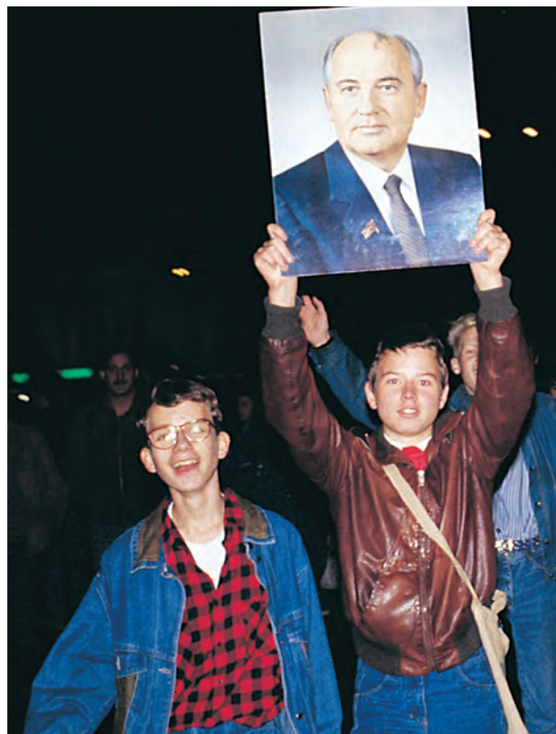
Polish demonstrators raise a placard with Mikhail Gorbachev's photograph, illustrating the impact of his reforms on the collapse of communism in Europe.

complained in 1971 that “the dead and by now also grotesque creature called Marxist-Leninism still hangs at the necks of the rulers like a hopeless tumor.”