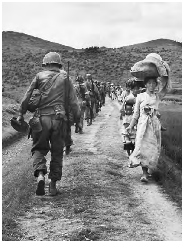
In August 1950, U.S. troops marched toward North Korea while South Koreans moved in the opposite direction to escape the fighting.

People's Republic of China to issue a warning; the U.S. incursion across the thirty-eighth parallel threatened Chinese national interests and could result in Chinese intervention in the Korean conflict.