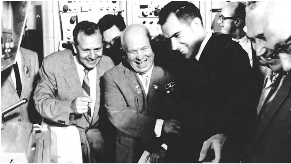
Soviet Premier Nikita Khrushchev and U.S. Vice President Richard Nixon sharing a rare “lighter” moment during the kitchen debate.

Third Reich, the forces of the United States, the Soviet Union, Britain, and France occupied Germany and its capital, Berlin, both of which they divided for administrative purposes into four zones. In accordance with agreements made at Yalta, specific travel corridors running through the Soviet occupation zone of Germany gave the French, British, and Americans access from their sectors in Berlin to their respective zones of occupation in western Germany. Tensions mounted between Soviet authorities and their western counterparts in 1947–1948 after the western powers decided to merge their occupation zones in Germany into a single economic unit and to introduce a new currency, the German mark, throughout their occupation zones and in their sectors of Berlin.