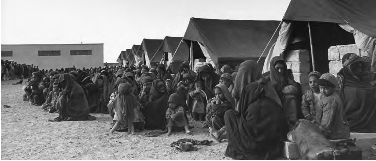
Afghan refugees fled to Iran in 1986, joining the ranks of the hundreds of thousands of forced displaced persons in the contemporary world.

nation camps. Following the war, the Soviet regime expelled ten million ethnic Germans from eastern and central Europe and transported them back to Germany. The largest migrations in the second half of the twentieth century have consisted of refugees fleeing war. For example, the 1947 partition of the Indian subcontinent into two independent states resulted in the exchange of six million Hindus from Pakistan and seven million Muslims from India. More recently, three million to four million refugees fled war-torn Afghanistan during the 1980s. According to UN estimates, at the end of 2003 there were some ten million refugees who lived outside their countries of origin and who could not return because of fear of persecution.