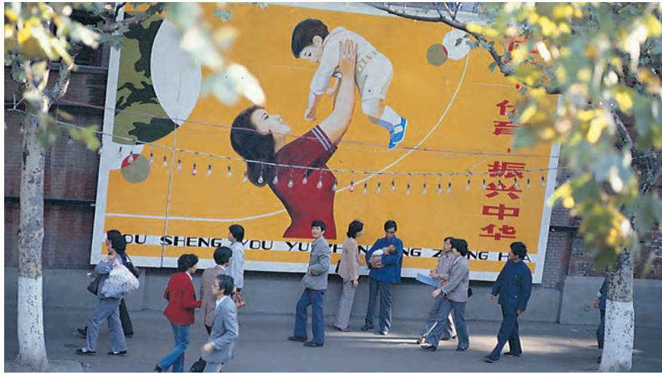
■ A poster advertising China's one-child family rule.

species. Global warming refers to a rise in global temperature, which carries potentially dire consequences for humanity. Atmospheric pollution causes global warming because the emission of greenhouse gases prevents solar heat from escaping from the earth's atmosphere.