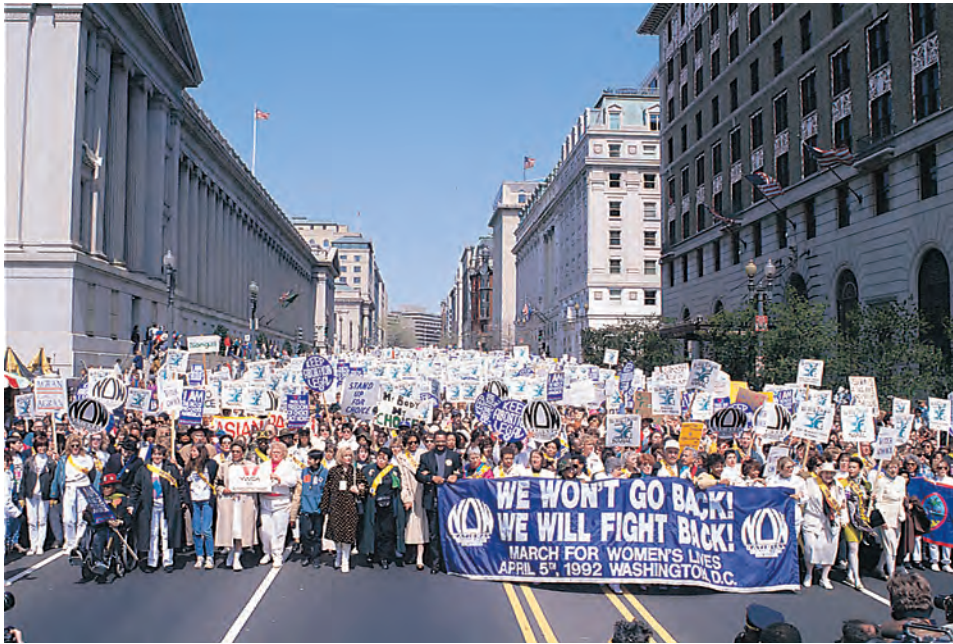
Women belonging to the U.S. feminist group the National Organization for Women march for equal rights in Washington, D.C., in 1992.

oping nations, but nowhere have they achieved full equality with men. Although women have increasingly challenged cultural norms requiring their subordination to men and confinement in the family, attainment of basic rights for women has been slow. Agitation for gender equality is often linked to women's access to employment, and the industrialized nations have the largest percentage of working women. Women constitute 40 to 50 percent of the workforce in industrial societies, compared with only 20 percent in developing countries. In Islamic societies, 10 percent or less of the workforce is composed of women. In all countries, women work primarily in low-paying jobs designated as female—that is, teaching, service, and clerical jobs. Forty percent of all farmers are women, many at the subsistence level. Rural African women, for example, do most of the continent's subsistence farming and produce more than 70 percent of Africa's food. Whether they are industrial, service, or agricultural workers, women earn less than men earn for the same work and are generally kept out of the highest paid professional careers.