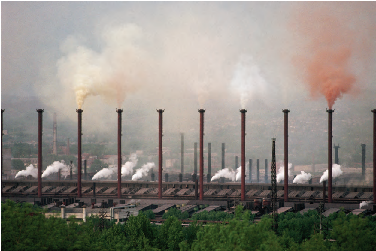
■ Smokestacks in Siberia releasing carbon dioxide emissions into the atmosphere.

The prophets of doom are not without their detractors, who have eagerly pointed out that the predictions of the Club of Rome and similar ones by other organizations and by concerned governments have not been borne out by the facts. For example, the Club of Rome predicted that the global reserves of oil, natural gas, silver, tin, uranium, aluminum, copper, lead, and zinc were approaching exhaustion and that prices would rise steeply. In every case but tin, reserves have actually grown since 1972. Eight years later the price for virtually all minerals—excepting only zinc and manganese—had dropped and continue to do so. The Club of Rome’s inaccurate predictions have not diminished its dystopian confidence. In a more recent and widely acclaimed work, Beyond the Limits (1999), the Club of Rome, while acknowledging that its earlier predictions had been too pessimistic, persisted in being equally pessimistic about the future.