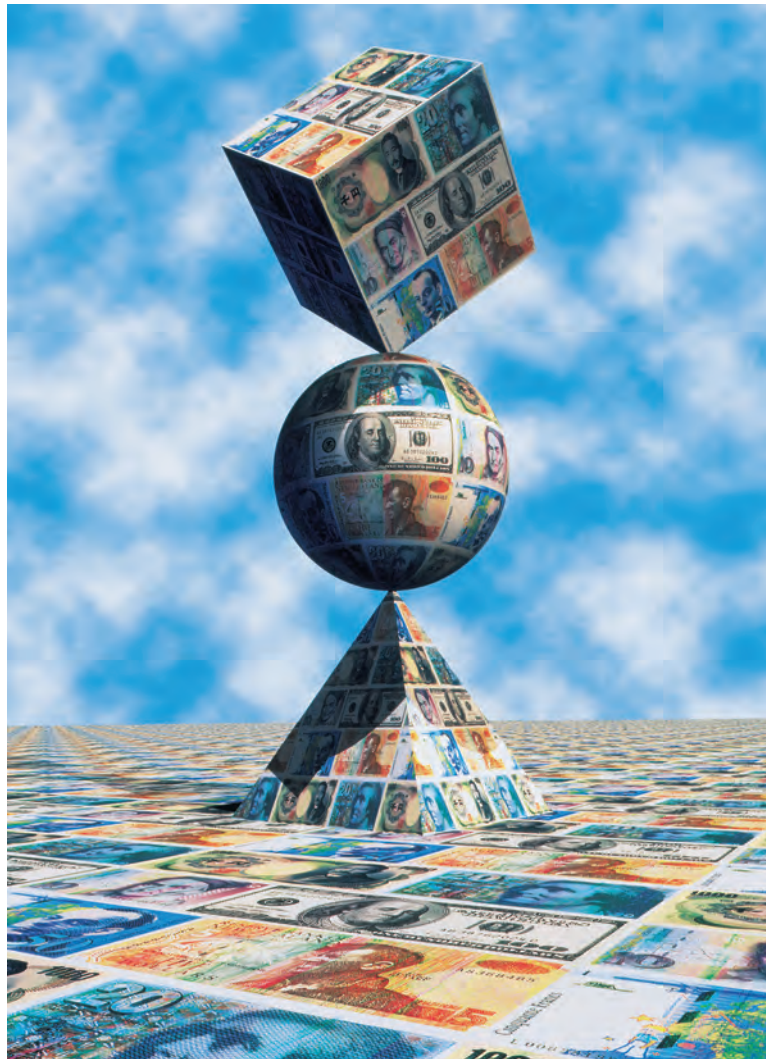
This image of a "Balanced World Economy" (1996) artistically expresses the precariousness of economic globalization.

fifty-five years, major corporations throughout the developed world have been operating under the constraints of a social compact with their employees and communities. Through a combination of collective bargaining agreements, tax laws, and environmental regulations, these companies had to contribute to the welfare of their respective home communities. Highly mobile global corporations that are no longer bound to any particular location have managed, however, to escape those obligations and break the social compact. Competing with companies around the world, the global corporation has moved jobs from high-wage facilities to foreign locations where wages are low and environmental laws are weak or nonexistent. The implications of this development are serious. For example, U.S. federal tax receipts show that corporations that once paid 30 percent of all federal taxes now pay only 12 percent. This trend is not confined to the United States but is visible throughout the industrialized world. In all instances, declining corporate taxes mean less money for social services and welfare programs.