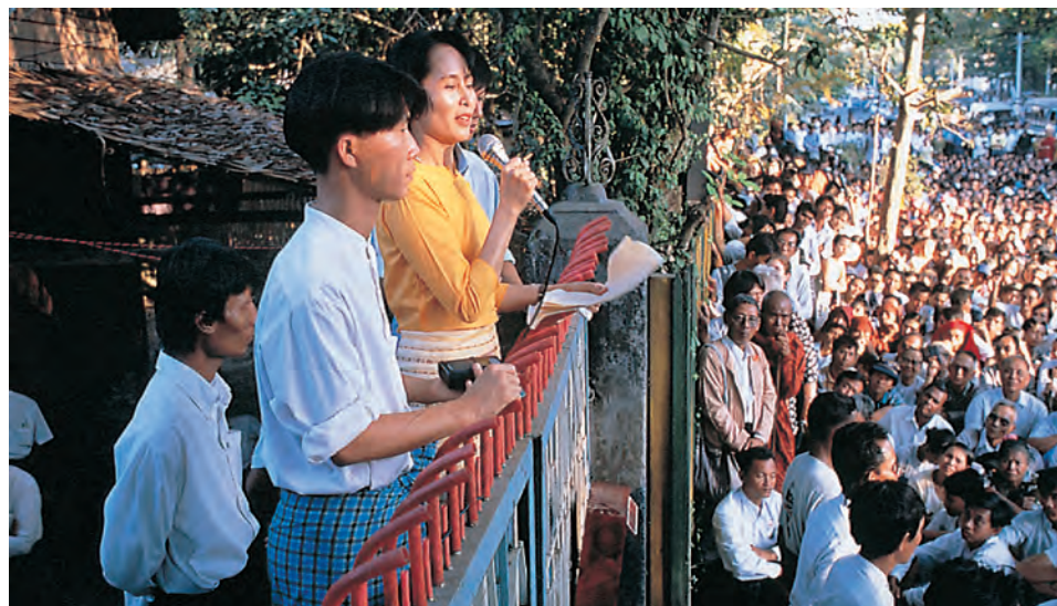
Opposition leader and Nobel Prize winner Aung San Suu Kyi at a gateside meeting in Rangoon, Myanmar.

also elevated numerous women to positions of power, breaking down other political barriers. Indira Gandhi (1917–1984) and Benazir Bhutto (1953–) led India and Pakistan as effective politicians, having been raised by fathers who themselves were prominent in politics. In 1994 Chandrika Bandaranaike Kumaratunga (1945–) became the first female president of Sri Lanka. Both her parents had previously served as prime ministers; her mother, Sirimavo Bandaranaike (1916–), became the first elected woman prime minister in 1960. As president, Kumaratunga appointed her mother to serve a third term as prime minister.