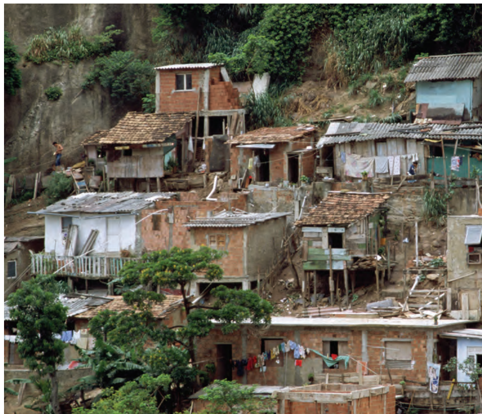
■ A Rio de Janeiro slum.