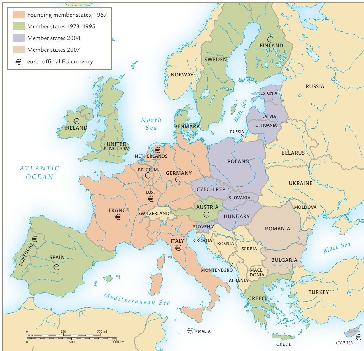
Map 40.1 European Union membership, 2004. In 2007 the European Union celebrated the fiftieth anniversary of its founding as a supranational and intergovernmental organization that encompasses twenty-seven member states. What major challenge faced the European Union in the twenty-first century?

many developing nations, but its members—also developing nations—demonstrated how the alliance could exert control over the developed world and its financial system. OPEC's influence diminished in the 1980s and 1990s as a result of overproduction and dissension among its members over the Iran-Iraq War and the Gulf War.