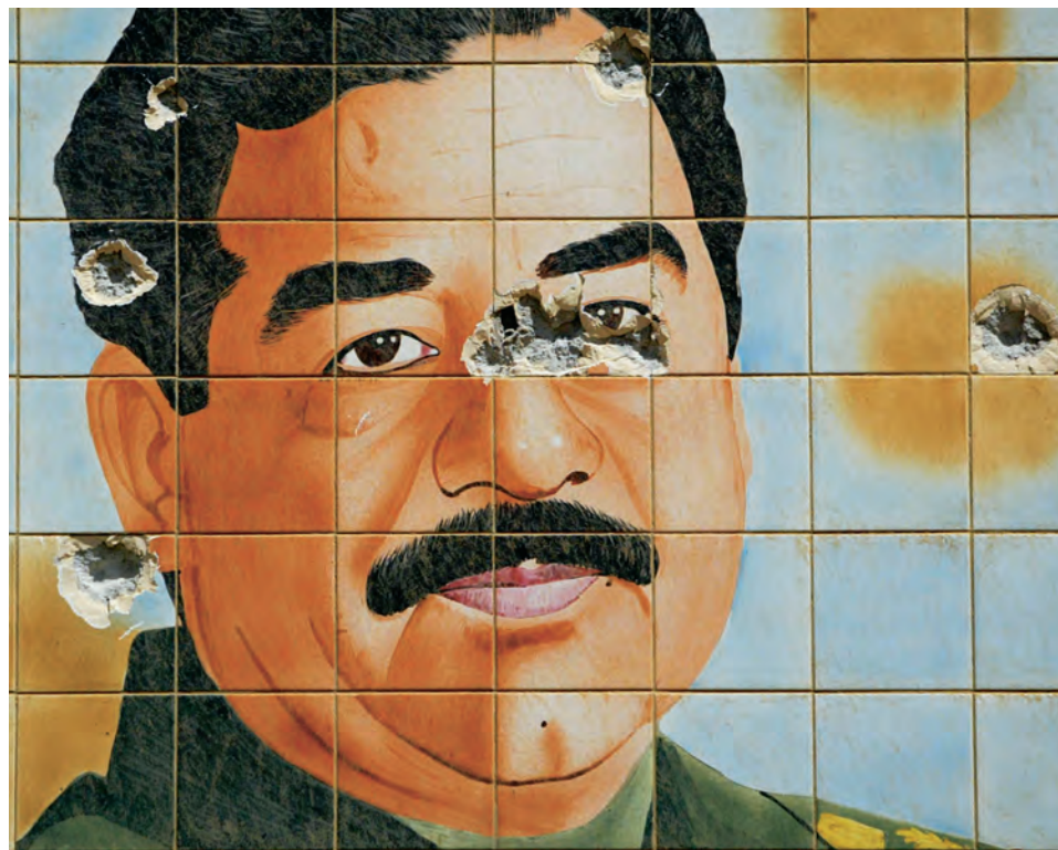
A photographer captured the ruin of Saddam Hussein in this image of a tiled mural pitted and pocked by the destruction in Baghdad as a result of Operation Iraqi Freedom.

$4 billion per month to maintain troops in Iraq. While President Bush sustained the United States' willingness to pay such a price, some critics in the United States and around the globe balked at the president's aggressive approach to the war on terrorism. Dubbed by some the "Bush Doctrine of Deterrence," his preemptive strike against Iraq—which had not overtly committed a terrorist act or been proven to harbor terrorists—set a troubling precedent in U.S. foreign policy. Moreover, the increased presence of foreign military personnel in Iraq may only serve to intensify the sort of Islamist fervor already fanned by Osama bin Laden.