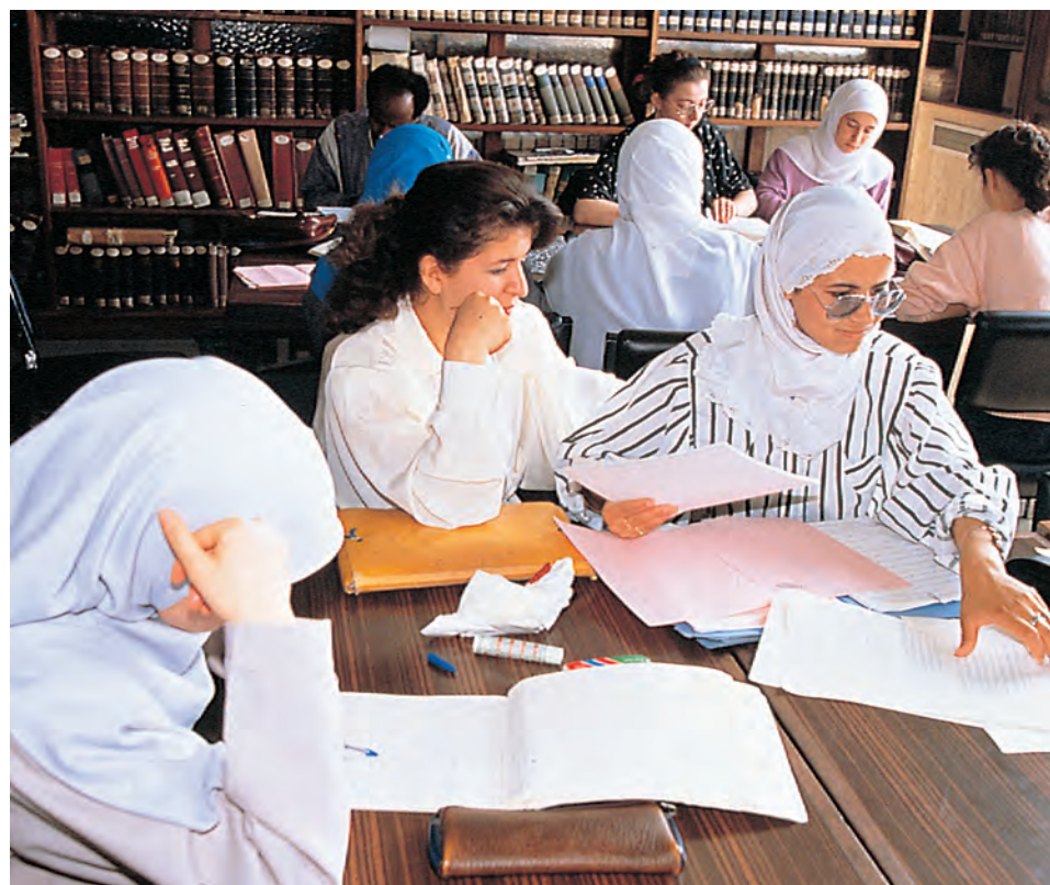
■ Education offers hope for the future of Muslim and Arab women.

workplace, women demanded full control over their bodies and their reproductive systems. Access to birth control and abortion became as essential to women's liberation as economic equality and independence. Only with birth control measures would women be able to determine whether or when to have children and thus avoid the notion that "biology is destiny." The U.S. Civil Rights Act of 1964 prohibited discrimination on the basis of both race and sex, and the introduction of the birth control pill in the 1960s and legal protection of abortion in the 1970s provided a measure of sexual freedom. The gender equality that an Equal Rights Amendment would have secured never materialized, however, because the amendment failed to achieve ratification before the 1982 deadline.