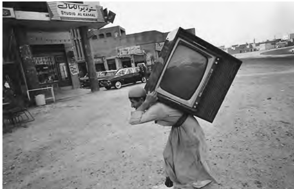
A citizen of Kuwait lugs a television through streets filled with European and U.S. consumer products. From tennis shoes to automobiles to English-language signs, cultural interpenetration is occurring around the globe.

Some societies have managed to adapt European and U.S. technology to meet their needs while opposing cultural interference. Television, for example, has been used to promote state building around the world, since most television industries are state controlled. In Zaire, for example, the first television picture residents saw each day was of Mobutu Sese Seko. He especially liked to materialize in segments that pictured him walking on clouds—a miraculous vision of his unearthly power. The revolution in electronic communications has been rigidly controlled in other societies—including Vietnam and Iraq—where authorities limit access to foreign servers on the Internet. They thus harness the power of technology for their own purposes while avoiding cultural interference.